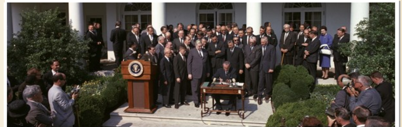
President Lyndon B. Johnson signs the Poverty Bill (also known as the Economic Opportunity Act) while press and supporters of the bill look on