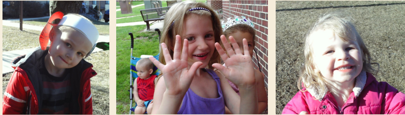
Pictured above are children residing at the Bridge Transitional Housing Facility.