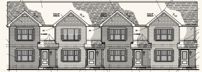
During the 2014 - 2015 Fiscal Year, SCA secured $1,000,000 in funding to construct six (6) rental units in the Borough of Girardville (pictured above). Four (4) of the units will be townhouse style family units, and two (2) of the units will be accessible to persons with disabilities.

Rental Development: SCA manages fifteen (15) rent restricted apartments in Schuylkill County. Through the '225 North Centre Street Limited Partnership,' SCA operates and manages six (6) apartments. SCA also owns and manages three (3) apartments in Port Carbon, one being accessible to people with physical disabilities, three (3) townhouse-style rental units in the Borough of Girardville and three (3) townhouse-style rental units in the Borough of Mahanoy City. Additional units are in the planning stages for Girardville & Ashland.